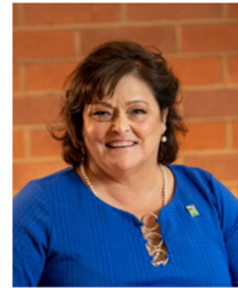
Catherine Moy Mayor, City of Fairfield