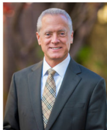
John Carli Mayor, City of Vacaville