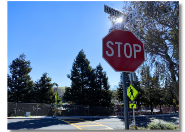
Installed RRFB. Funding awarded to Joe Henderson Elementary School (Benicia) from Cycle 1.

Projects to be constructed in the public Right of Way must be accompanied by a Letter of Support from the corresponding city/county Public Works Department. The city/county may also help identify project timeline and cost.