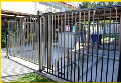
Secure bike storage installed with funding from Cycle 1 at Riverview Middle School (Rio Vista).

Ineligible expenses: Bicycles for individuals, food/refreshments, salaries, camera and other photography equipment, gift cards, stipends