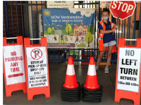
Dixon Montessori Charter School purchased safety equipment with funding awarded from Cycle 1.

Ineligible expenses: Bicycles for individuals, food/refreshments, salaries, camera and other photography equipment, gift cards, stipends