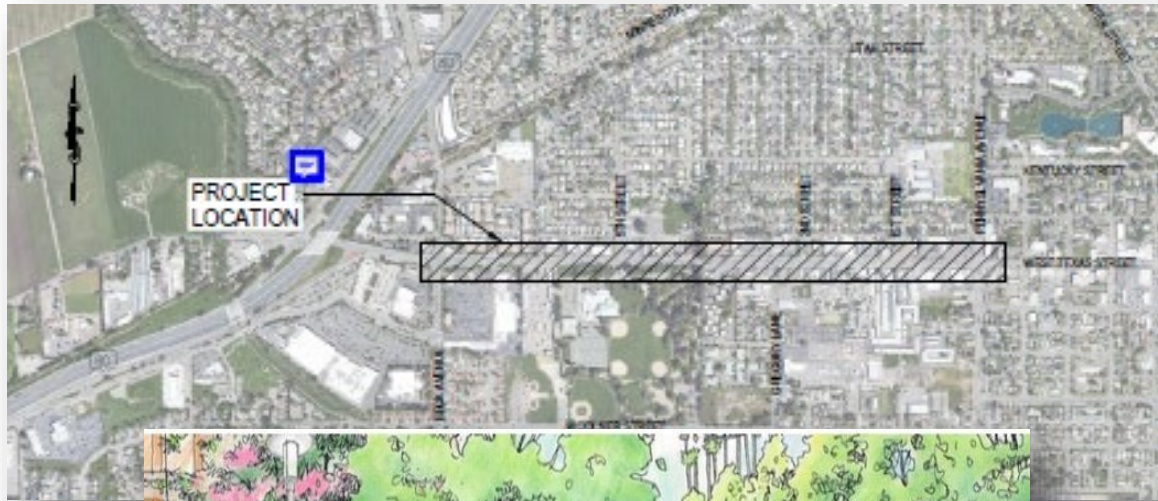
City of Fairfield West Texas Street Complete Streets Project $10.9 million Statewide ATP Cycle 5 (2021)