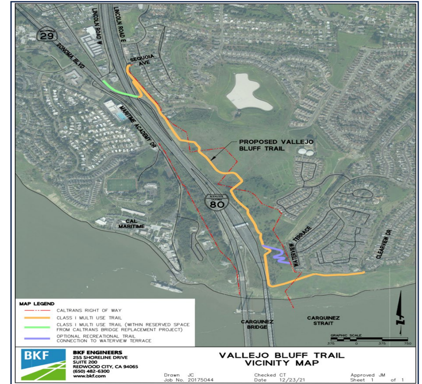
Priority Project – Vallejo Bluff Trail

ELIGIBLE PARTICIPANTS - cities, counties, transit operations, school districts, community colleges and universities