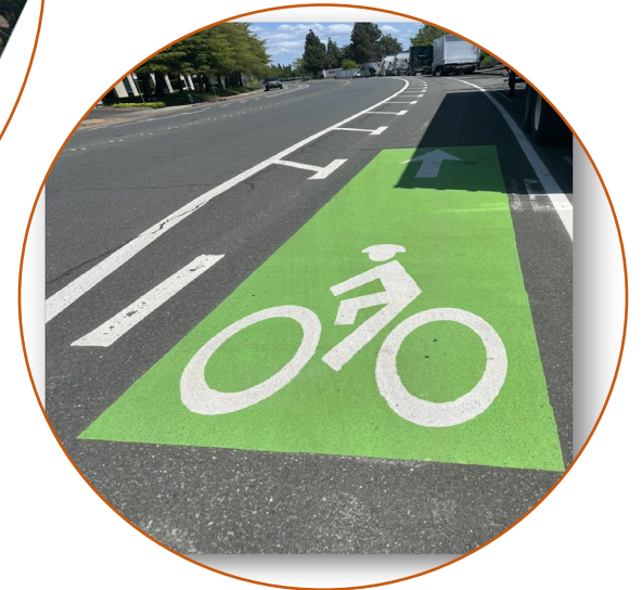
Suisun City- Rail Road Avenue Pavement Rehabilitation Project

Over the last three fiscal years, about $1.5 million was allocated to 12 active transportation projects located across Solano County.