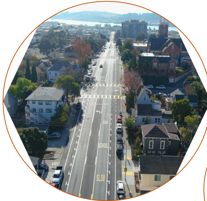
Vallejo - Sacramento Street Phase I