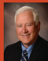
Steve Young Mayor of Benicia