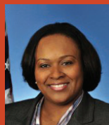
Lori Wilson Mayor of Suisun City