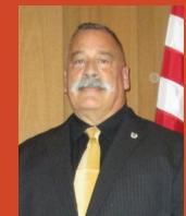
Steve Bird Mayor of Dixon