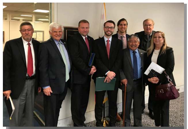
Office of Senator Diane Feinstein meeting with STA Board Members, SolTrans and STA Executive Director