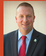
Ron Rowlett, Mayor, City of Vacaville