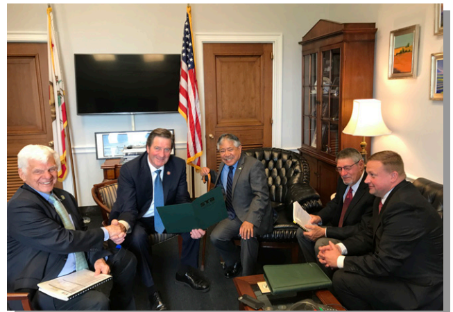
Representative John Garamendi meets with STA Board Members