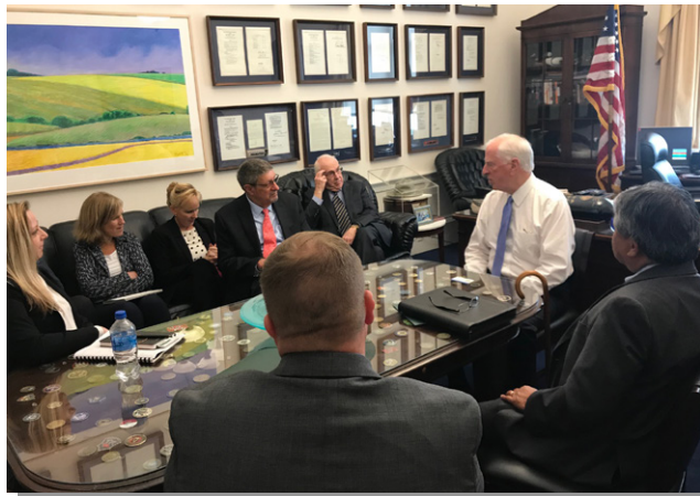
Representative Mike Thompson meets with STA Board Members and SolTrans Executive Director

Housing became the most prominent policy issue at the state level, meanwhile, the I-80 Managed Lanes Project remained the top focus of the STA at the federal level. STA Board Members and staff visited Solano County's Congressional Representatives and staff from federal agencies administering the Infrastructure for Rebuilding America (INFRA) and the Better Utilizing Investments to Leverage Development (BUILD) Grants. The I-80 Managed Lanes Project will continue to be the top priority for the STA in 2020.