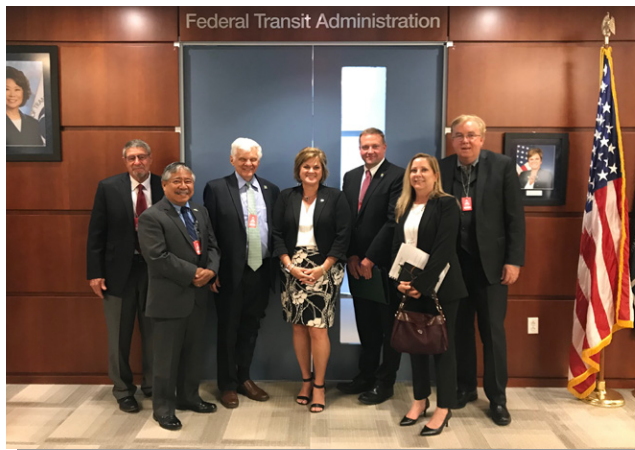
FTA Acting Director meets with STA Board Members and SolTrans and STA Executive Director