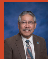
Bob Sampayan, Mayor, City of Vallejo