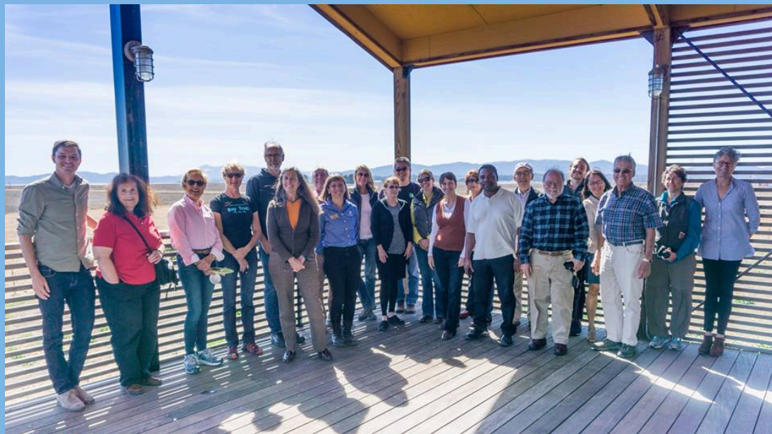
Bay Trail Board of Directors and staff, 2016