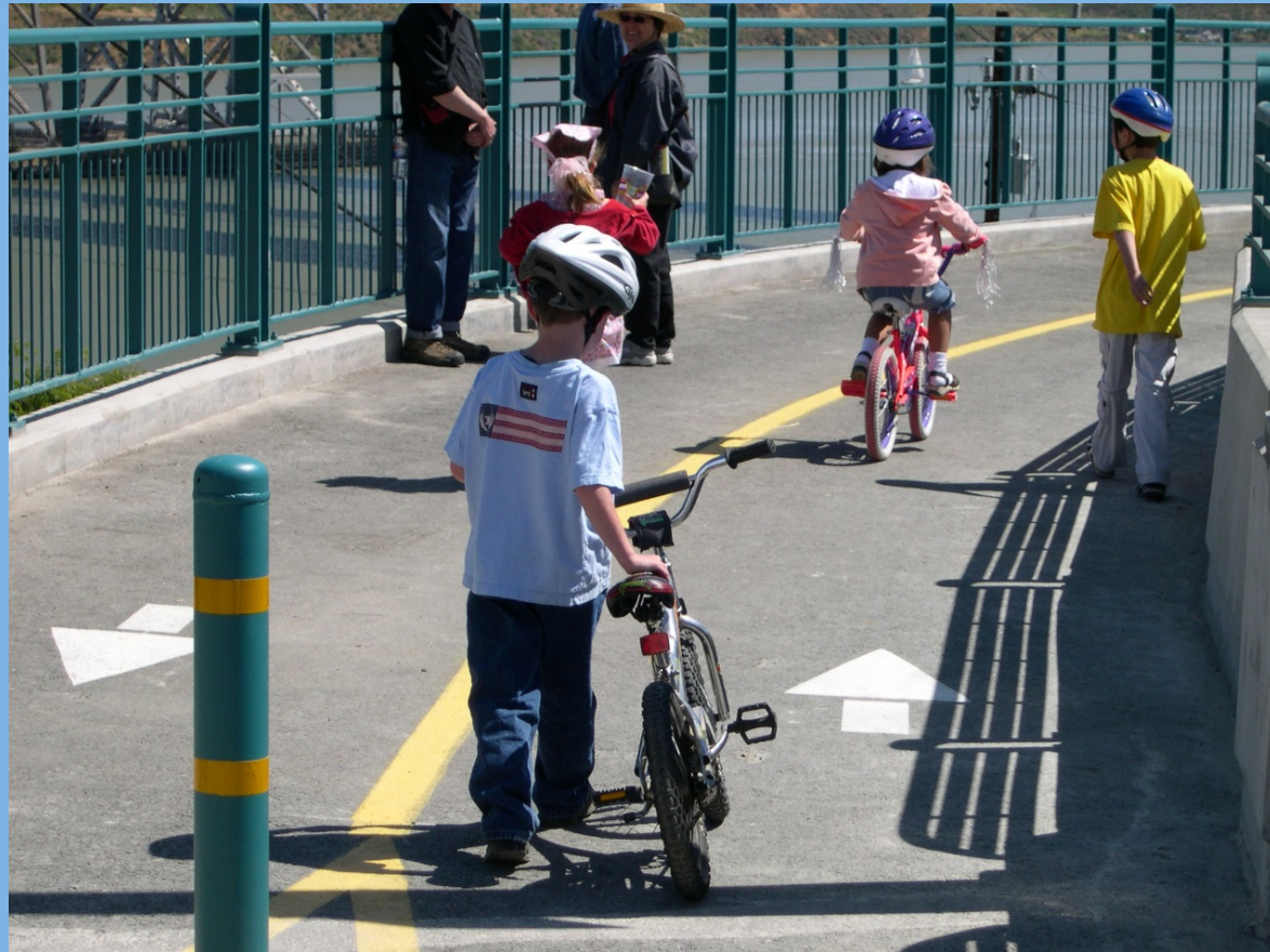
Bike/ped path on the Carquinez Bridge