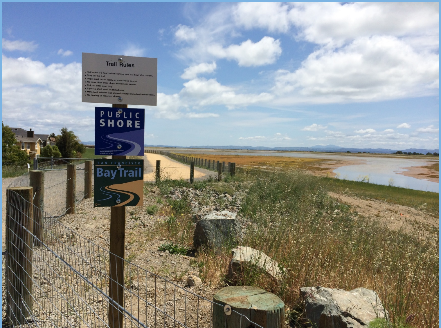
Hamilton Wetlands—3.5 miles of Bay Trail