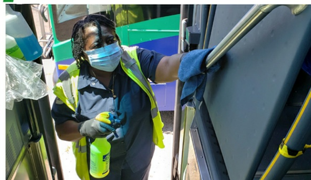
Post-COVID-19 Budget and Service Plan for Solano Express